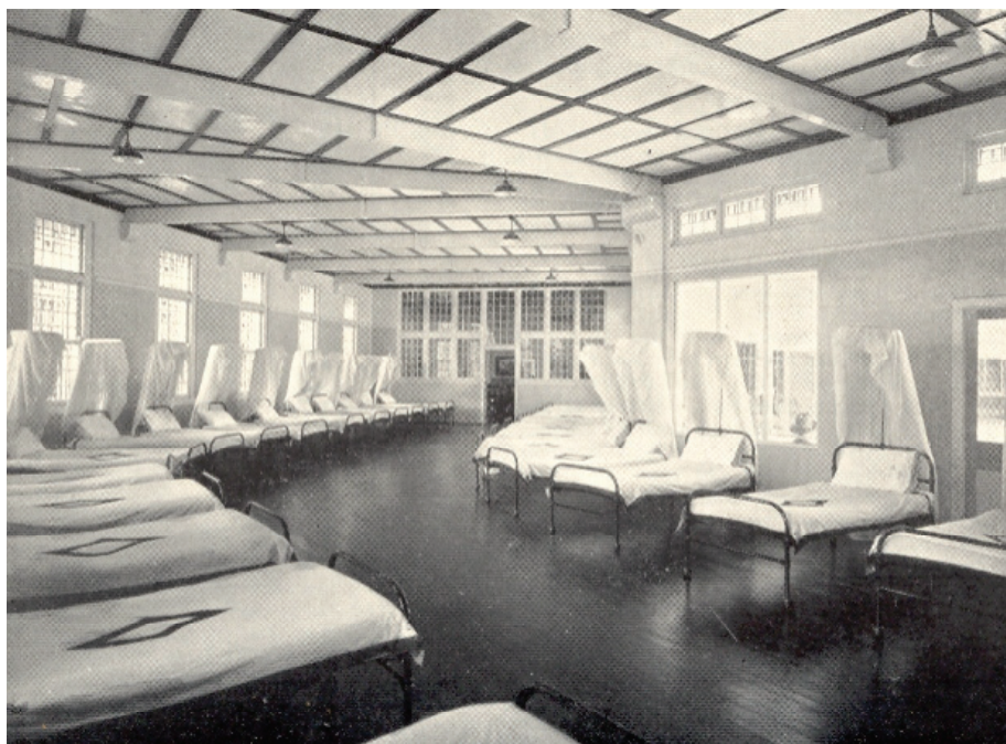
Figure 5: The mass institution — dormitory setting for a male ward, 1936