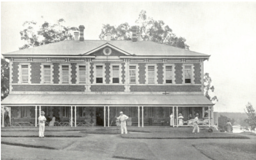
Figure 1: Wolston Park

We know about the first day at Wolston Park from a report in the Brisbane Courier of 1865. On 12 January of that year, seven prison warders (two of them women) and ten police constables escorted 57 male and twelve female lunatics from Brisbane Gaol ‘to the new Asylum at Woogaroo’. Since 1859, Queensland’s insane had no longer been sent to Sydney, but were lodged instead at the Brisbane Gaol. Now the asylum was ready, its residents were loaded into cabs and taken down to the river. There they boarded a steamer named Settler and were conveyed down the river to the landing point near Woogaroo Creek. The name of the asylum hinted at the reality that this was Aboriginal land: the word Woogaroo, so it was remembered in the 1930s, being a corruption of an Aboriginal word meaning ‘to step over a person lying down’. 1 Aboriginal people would be among the earliest inhabitants of the asylum, but not in great numbers. Instead, the institution was rapidly filled from its earliest days with the immigrant settlers who made up most of the colony’s growing population.