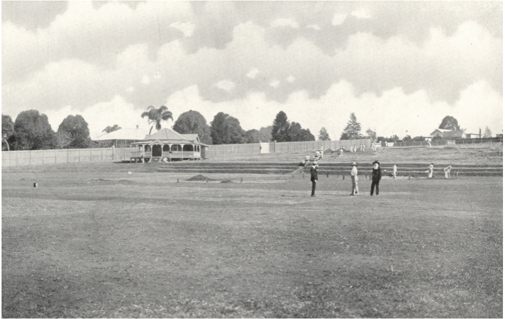
Figure 3: Occupational therapy: patients building Ellerton’s cricket ground, 1911