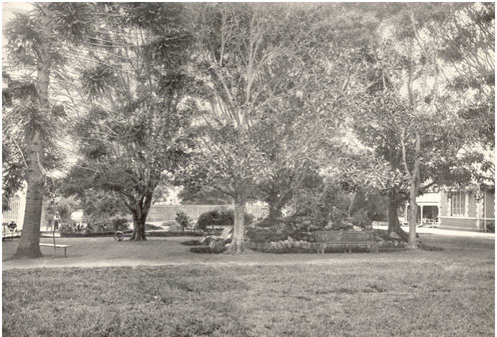
Figure 4: Moral therapy — Ellerton’s gardens and rockeries at Male Ward 5, 1913