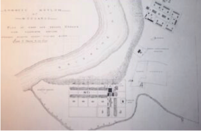
Figure 2: Asylum by the river — the vision in 1869

The Woogaroo Asylum was not only constantly relocated — it was endlessly renamed. Every generation wanted to put its own stamp on the site and its functions. The renaming reflected both changing fashions in psychiatric care and a desire to escape the stigma associated with an institution for the insane. So Woogaroo quietly became Goodna Asylum for the Insane some time in 1880, perhaps to allow its reputation to regenerate in the wake of four official inquiries into Woogaroo after 1867. In 1898, it appears as the Goodna Hospital for the Insane, the name for the next 40 years, until it became the Brisbane Mental Hospital about 1940. We know much more about this change since it was so purposeful. Under the youthful influence of the new medical superintendent Basil Stafford, and with the strong support of the Labor Minister for Health Ned Hanlon, Queensland reviewed its legalisation and administration, abolishing the terms ‘insane’, ‘insanity’ and ‘asylum’, and re-establishing a network of mental hospitals within a department of ‘Mental Hygiene’.