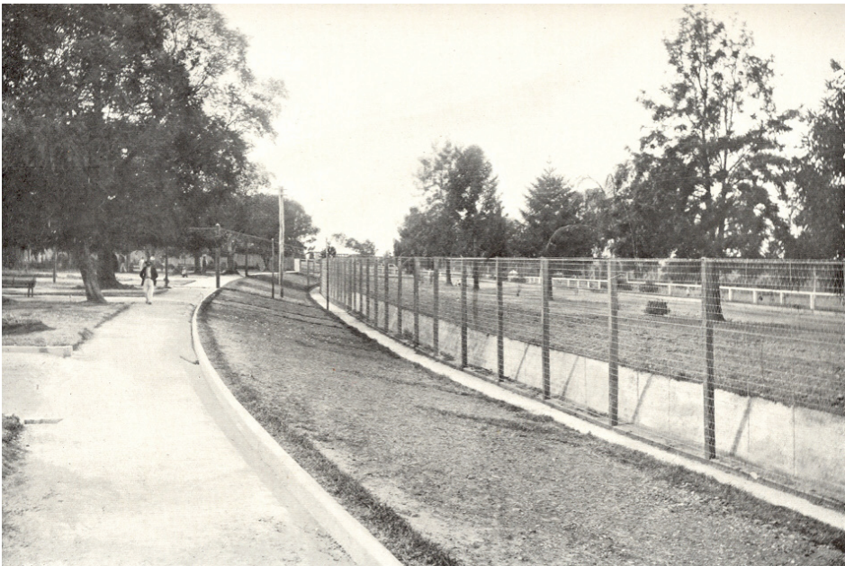
Figure 8: The dilemma of the asylum — the sunken fence, 1917

The Chermide Unit had contributed largely to the decline in the number of admissions, while other special facilities were being created around the state. 30 Further changes were evident in the higher rates of early discharge, with those discharged in